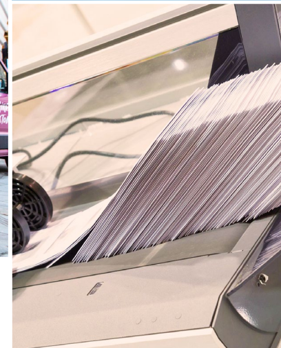
MAIL & FULFILMENT