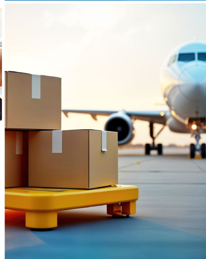
COURIER & FREIGHT