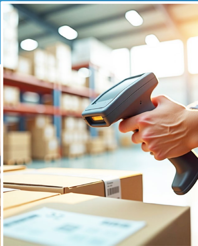
STORAGE & LOGISTICS