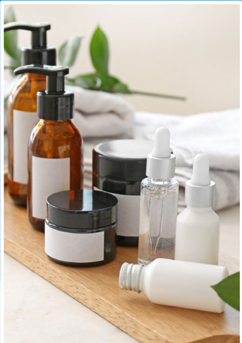
HEALTH & WELLNESS