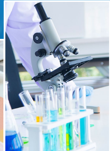
RESEARCH & DEVELOPMENT